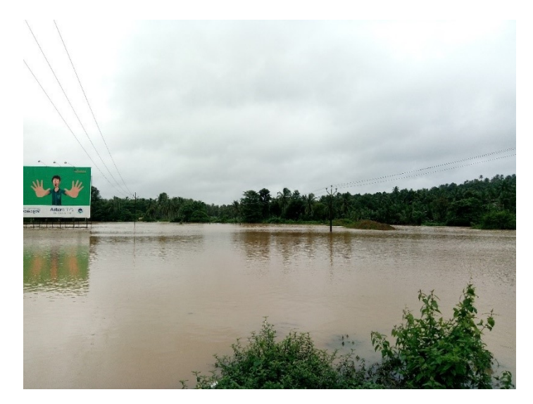
Figure 1. The submerged agricultural land of Malkapuram [7].

The economy and the livelihood of the nationals of some countries entirely rely on agricultural lands. Due to flooding, the fertile agricultural land becomes less fertile or infertile due to soil erosion, and sedimentation. The upper fertile soil layer of the cultivable land is washed off with the high-speed flow of the flooding water. The productivity of such agricultural lands is reduced by 40 percent. As water seeps into such flooded land the extra moisture will make the winter season crops difficult to grow. Flooding water affects the nutrient content of the soil leaving it nutrient deficient. Nitrogen is a necessary component needed for the plant defense mechanism. Due to washing off of the fertilizers, the nitrogen is not available to the plants making them susceptible to the pests attack and affecting the productivity of the crops. Stagnant floodwater also weakens the plants and makes them not being able to maintain their posture and eventually leads to their death. So to avoid the aftermath of the flood on agricultural land a proper plan is needed[6].