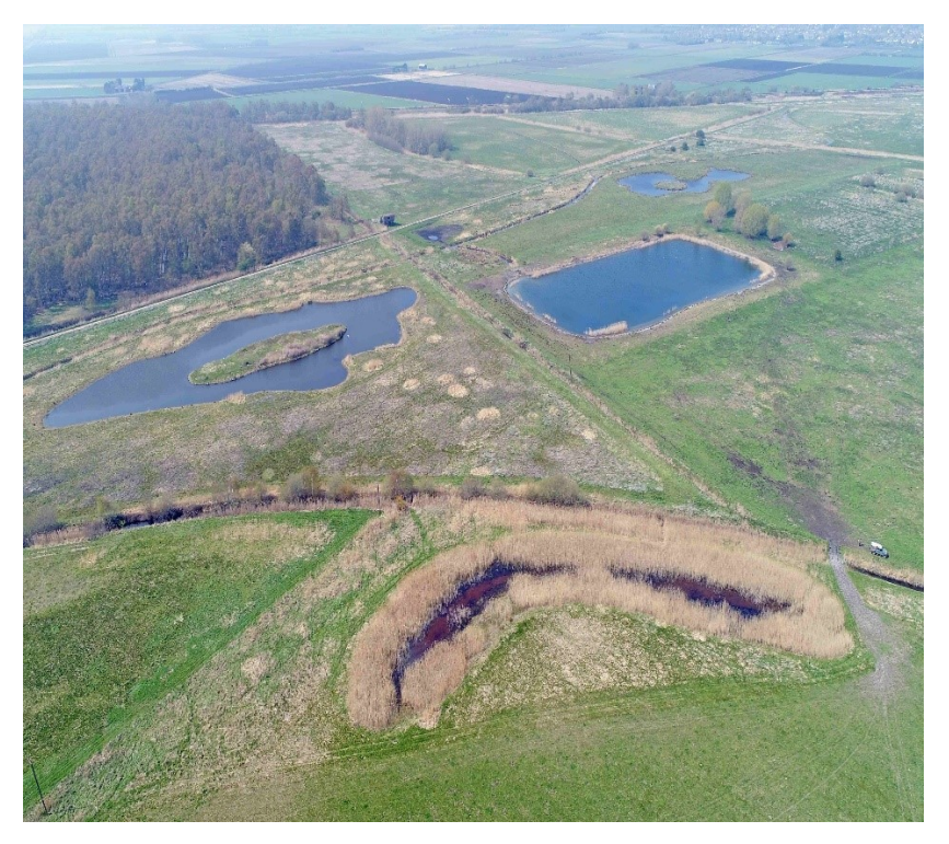
Figure 4. Great Fen depicting new ponds and woods [17].