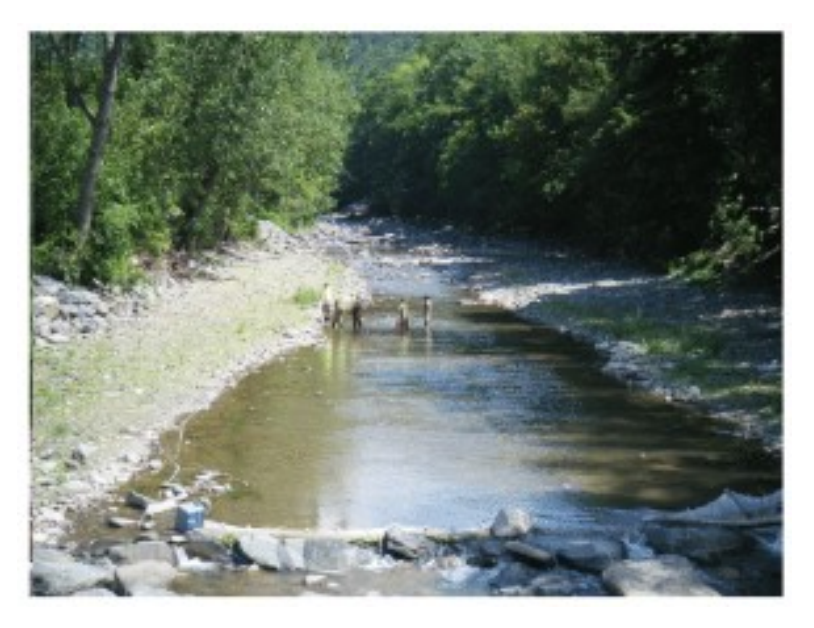
Figure 2. Stony Clove Creek for surveying fish [13].